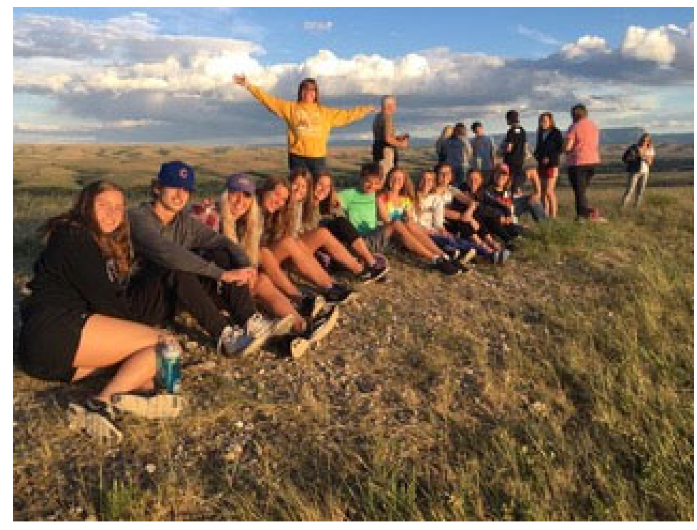
The group gathered for an outing at the Willow Creek Dam near Lodgegrass to enjoy the sunset.